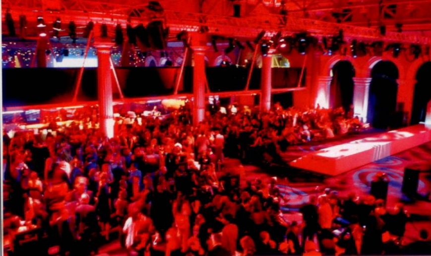
The fabulous venue